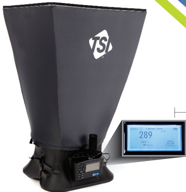
Model 8380 (Accessories shown on following page)