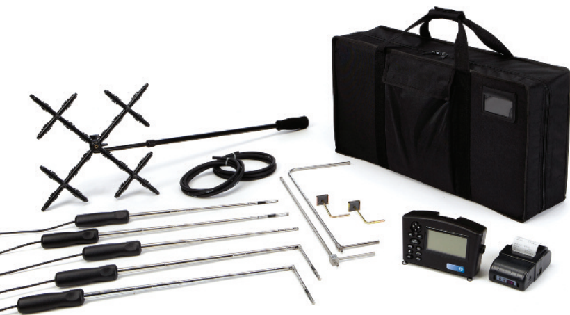
Model 8715 (Micromanometer shown with standard and optional accessories)