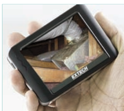
Detachable wireless 3.5" color TFT LCD display can be viewed from a remote location up to 32ft (10m) from the measurement point.

Complete with 4 AA batteries, rechargeable display battery, microSD memory card with SD adaptor, USB cable, extension tools (mirror, hook, magnet) video interconnect cable, AC adaptor (100-240V, 50/60Hz), magnetic base stand, and hard case