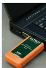
BRD10 - Optional Wireless USB Video Receiver allows user to stream live video to a PC and also can be remotely viewed via VOIP connection